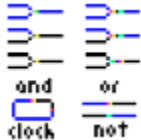
Spiral Demon Computer Components

AutoCell 2.0 offers a large, variable field, drawing, editing and zooming tools, sophisticated document handling, a 256 color palette, and a user-friendly interface.